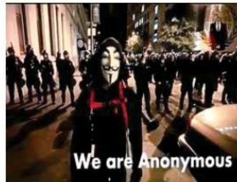
The anti-authority members of Anonymous sometimes appear in Guy Fawkes masks.